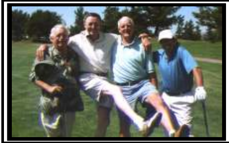
Our MC & Friends