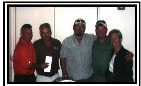
1st Place Flight B