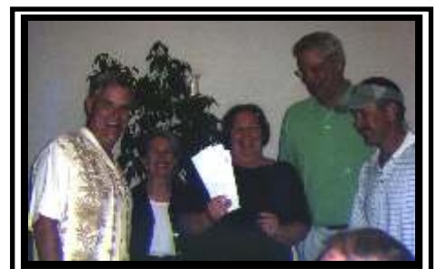
2nd Place Flight B