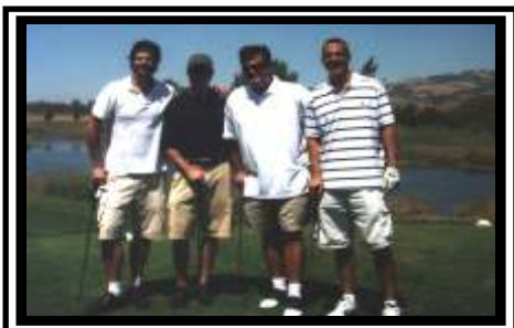
3rd Place Flight B