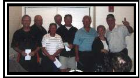
1st & 2nd Place Flight A (Tied Score)